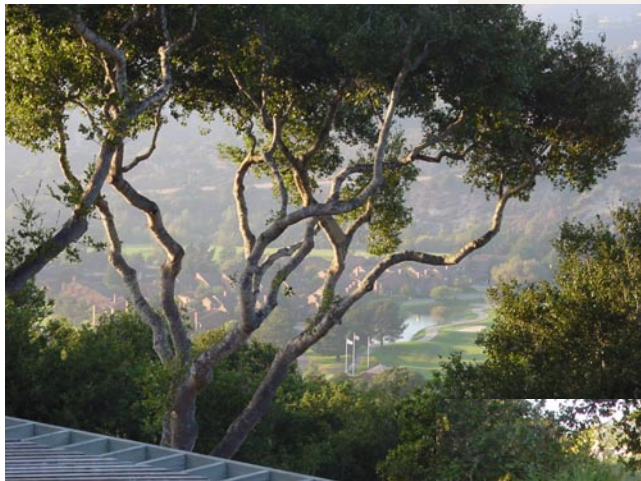
TeleSoft's Annual LP Meeting was held October 1-3 at the lovely Carmel Valley Ranch in Carmel, CA.